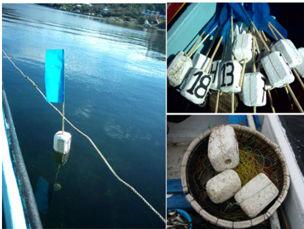
PLATE 1 Artisanal drift line known as atorrante . Left, settled line in shallow waters to show line's detail and its bottom weight. Upper right, buoy and flags. Bottom right, line and hooks.

what is considered to be a globally important breeding area for albatross species (Moreno & Robertson, 2008). Isolated fishing areas and extreme weather in this part of Patagonia encourage the creation of seasonal camps, where additional interactions between fishermen and seabirds could have detrimental effects on seabirds.