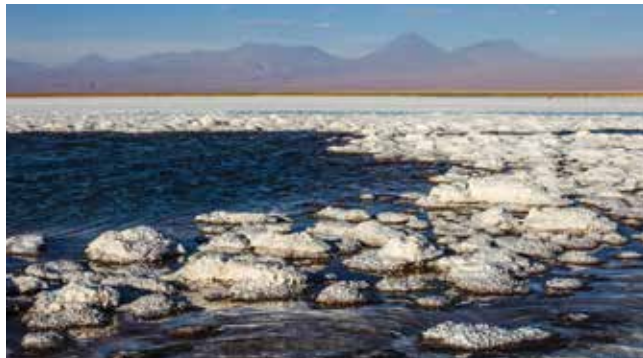
▲ Figure 2. Salar de Atacama is Chile's largest salt flat, and the world's largest source of lithium.

Chile holds more than half of the world's lithium reserves, and in 2012 ranked first (tied with Australia) in lithium production, producing 13,000 m.t. Chile's lithium oxide and lithium hydroxide production reached 5,300 m.t. in 2012. Two Chilean companies — SQM and Sociedad Chilena del Litio — dominate the global lithium market, extracting brines from the Salar de Atacama in the Antofagasta region. Because Chile considers lithium a substance of strategic importance, and because of its potential use in nuclear power generation,