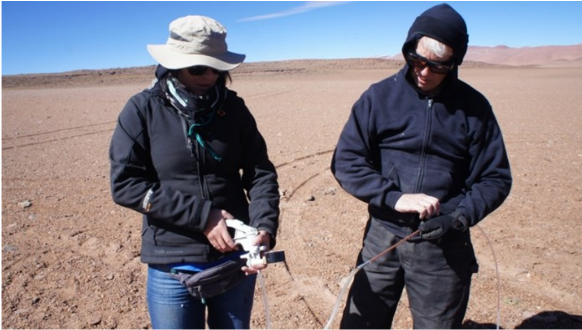
Figure 7. The collecting of gases into a copper tube.