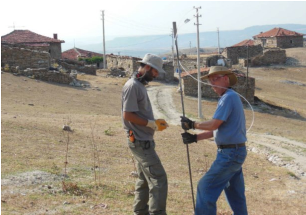
Figure 4. Inserting hollow sampling rod and tubing in the pilot hole for gas collection.

Step 2. Drive a hollow gas recovery rod with tubing attached to the gas recovery point into the pilot hole with a hammer drill or slide hammer.