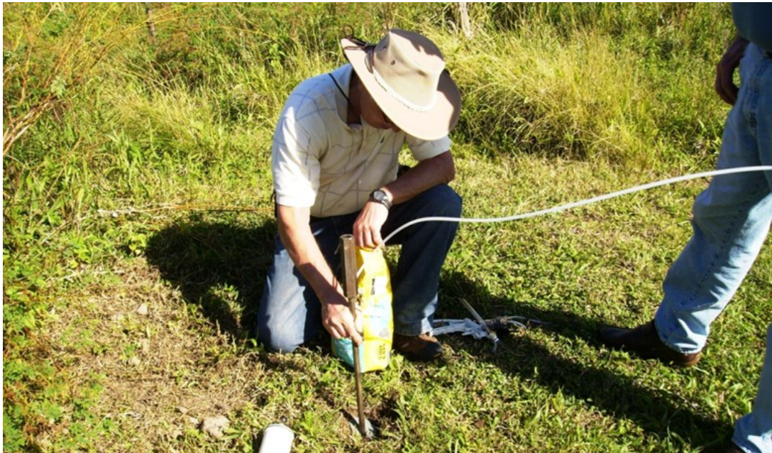
Figure 5. Sealing of the sampling rod annulus with bentonite.

Step 3. Seal the borehole annulus to reduce atmospheric air contamination.