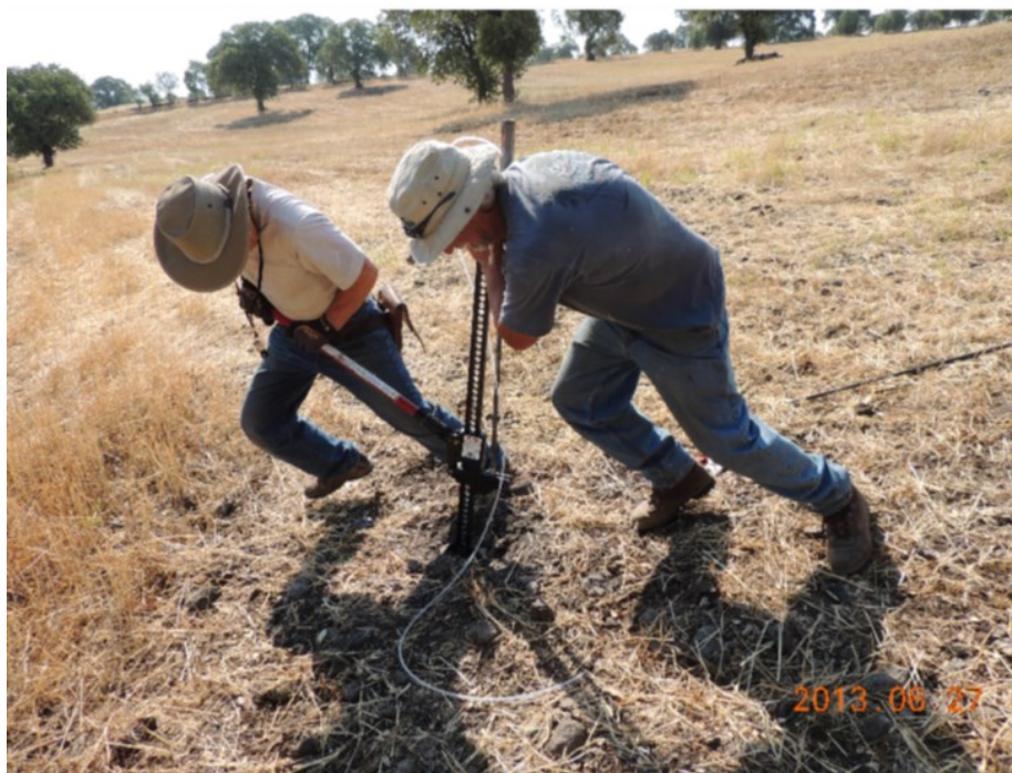
Figure 9. The removal of the gas sampling rod and tubing with a modified jack.

. Step 6. Remove hollow gas sampling rod and tubing and abandon borehole