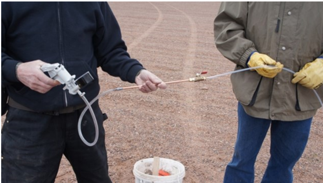
Figure 6. Purging of the sample tubing and copper tube.

Step 4. Connect copper sampling tube and hand vacuum pump to the sample tubing and purge the tubing and copper tube.