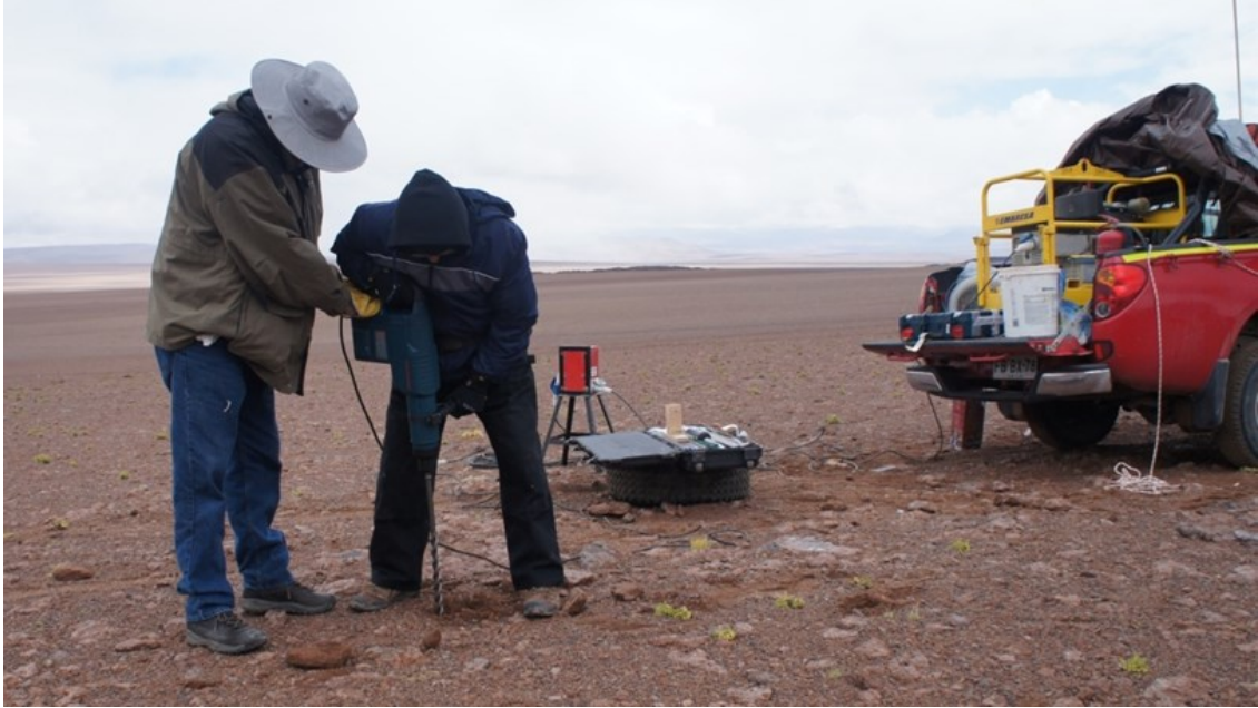
Figure 3. Rotary hammer drilling with auger bit in competent rock for gas sampling pilot hole.

Step 2. Drive a hollow gas recovery rod with tubing attached to the gas recovery point into the pilot hole with a hammer drill or slide hammer.