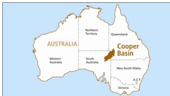
Figure 1. Location of the Cooper Basin in Australia.

The Cooper Basin region straddles the Queensland/South Australia border (Figure 1) and forms part of a large area of uniquely high-heat flow attributed to Proterozoic basement rocks enriched in radioactive elements (Meixner and Holgate, 2009).