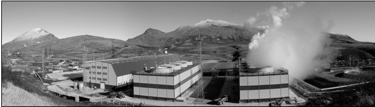
Figure 4. The first Mutnovsky geothermal power plant of 50 MWe capacity.

Kaluga Turbine Works SC, are located. Every section of the air-condenser consists of 8 units with steel galvanized tubes, ribbed with aluminium ribbon.