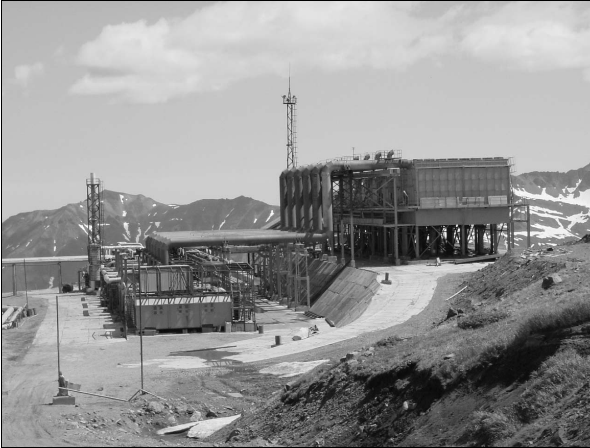
Figure 2. First environmental friendly pilot Verkhne-Mutnovskaya geothermal power plant of 12 (3x4) MWe capacity.

Two-phase flow from the production wells by pipeworks enters the collector and then, after the two-stage separation system, the saturated steam comes to three power units of 4-MWe capacity each (Fig. 3). Steam pressure at the turbine inlet amounts to p_0=0.8 MPa (at about 170^{\circ}\text{C} temperature). Steam humidity degree is not higher than 0.05% that ensures low content of salts in the turbine steam. To increase the efficiency of geothermal fluid the hot brine is transported to the expander, working at nearly 0.4 MPa pressure. Steam is produced in expander and is used in ejectors to remove non-condensing gases from the condenser. Non-condensing gases are dissolved in absorber in the worked out geothermal fluid, which is further re-injected into the re-injection wells.