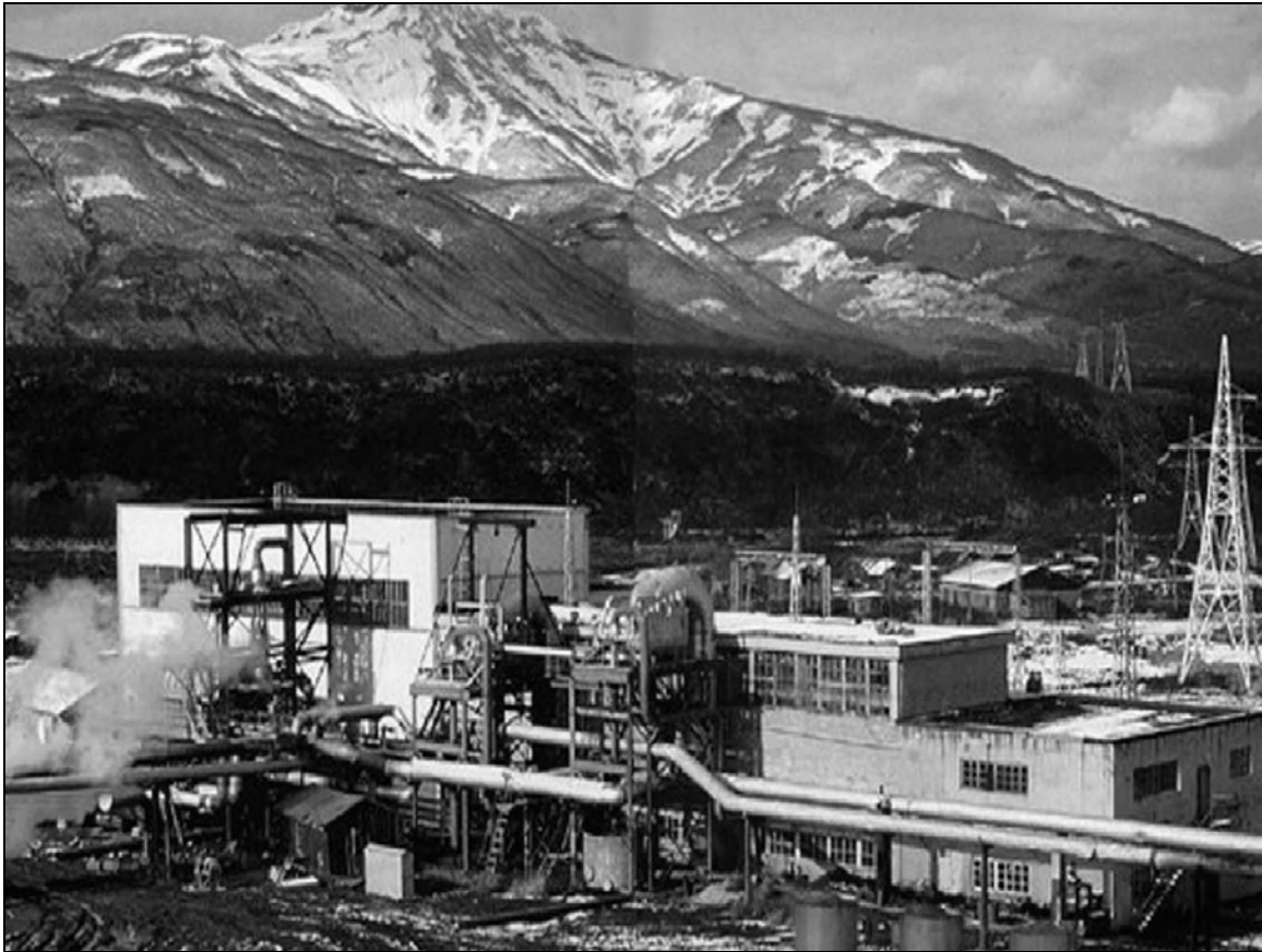
Figure 1. Pauzhetskaya geothermal power plant (11-MWe) operating since 1967.